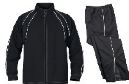
Athletic Twill Track Suit (black/black, black/red, navy/navy, white/red) $110

To order, contact Dan Morris at secretary@czrc.ab.ca All orders must be pre-paid by cash or chit deduction. Extra charges will apply for sizes larger than XL.