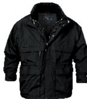
3-in-1 Winter Parka (black) $120