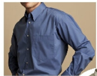
Dress Shirt (black, blue, navy, tan) $50