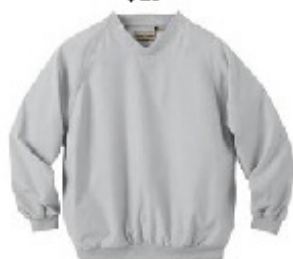
Wind Shirt (black, grey, blue, red) $50