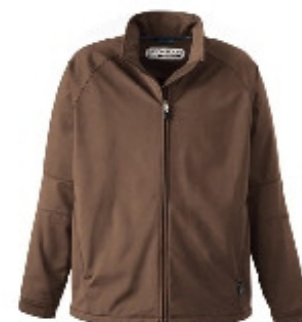
Technical Jacket (black, brown, blue) $90