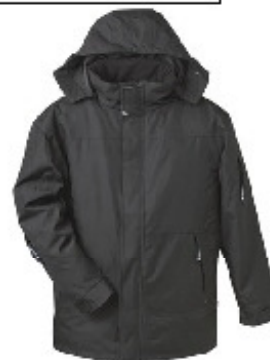
Insulated Parka with removable hood (black/grey, black/red) $140