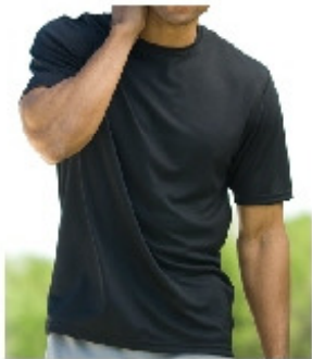
Microfiber T-Shirt (black, red, white) $20

To order, contact Dan Morris at secretary@czrc.ab.ca All orders must be pre-paid by cash or chit deduction. Extra charges will apply for sizes larger than XL.