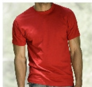
Moisture Wicking T-Shirt (black, red, white) $20