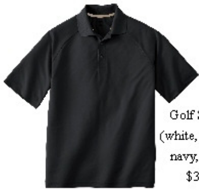
Golf Shirt (white, black, navy, red) $35