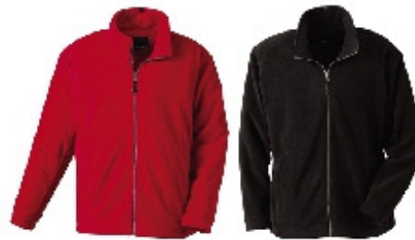
Fleece Jacket (black, navy, red) $50