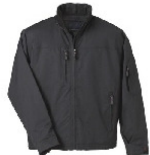
Insulated Jacket (Black or Navy) $110