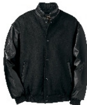
Black Leather and Melton Jacket $140