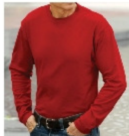
Moisture Wicking Long Sleeve Shirt (black, red, white) $25